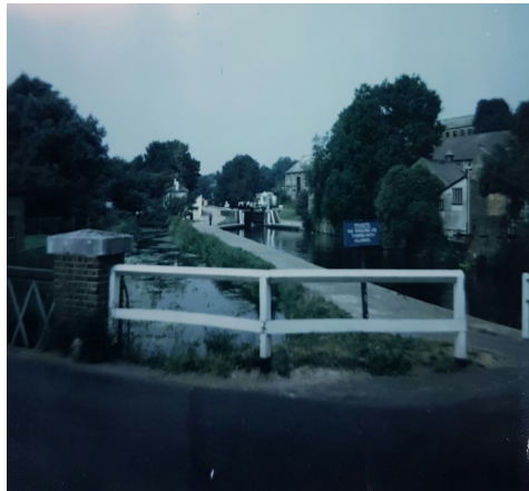
Photos from 1974 prior to Coppermill Lock Conservation Area designation, including examples of unattractive industrial buildings which have since been replaced.