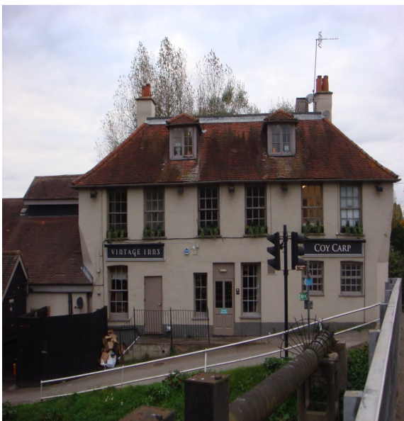
Below: Coy Carp Public House