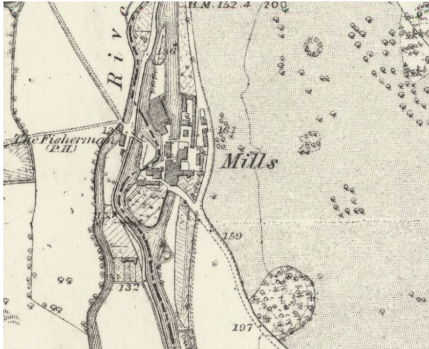
Ordnance Survey map from 1868 showing the Fisherman Public House (now Coy Carp) with the fishery cottages to the south and the Harefield Mills on the opposite side of the canal