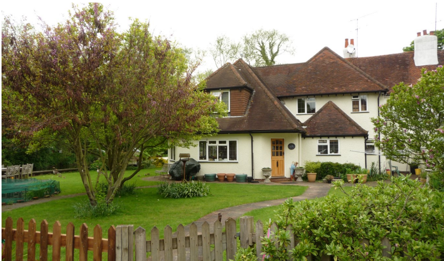
Left: Fishery Cottages