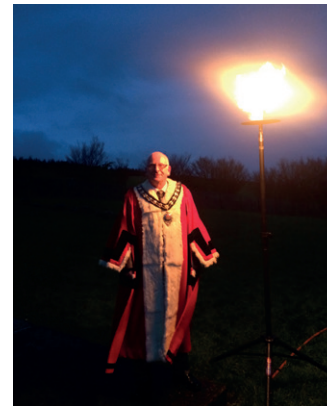
Gas fuelled Beacon, East Antrim, Northern Ireland.