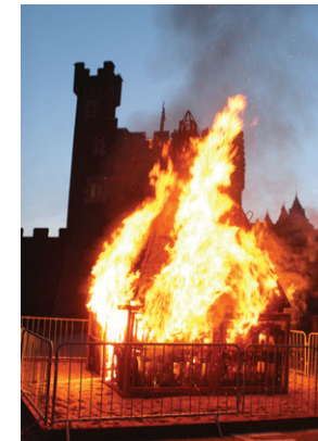
Bonfire Beacon, Killyleagh, County Down, Northern Ireland.