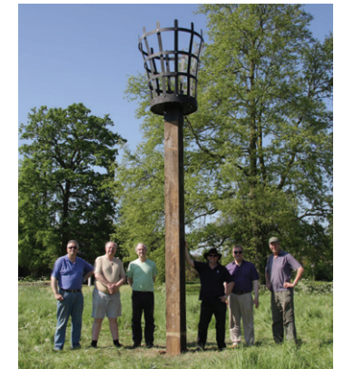
Wood fuelled Beacon Brazier, Hilton, Derbyshire, England.