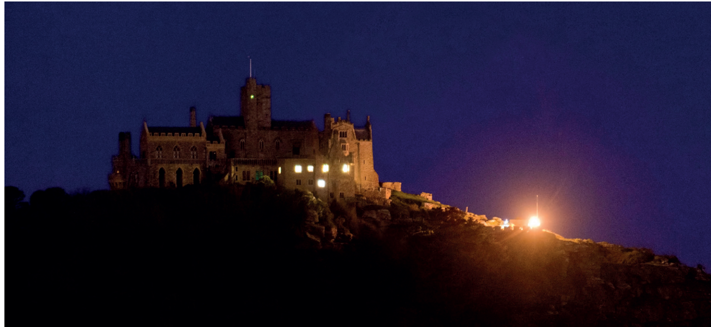
Gas fuelled Beacon, St Michael's Mount, Cornwall.

The Beacon is stable in the wind. It is supplied with a ground anchor and rope for securing to the ground if this is possible, or else we would recommend the use of sand bags. Full instructions are provided for this. The Beacon must be supervised by 2 people at all times when lit and a fire extinguisher must be provided. It is important that the supervision should be undertaken those who are competent and it is essential that a trial be undertaken before the event to ensure that everyone is fully trained and familiar with the operation.