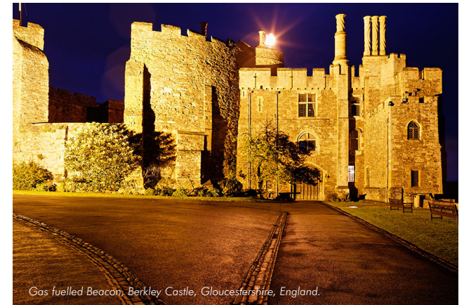
Gas fuelled Beacon, Berkley Castle, Gloucestershire, England.

Payment by cheque, BACS transfer, or Credit/Debit Card. Last date to order to guarantee delivery by 14th April is 29th February 2016. However please enquire after this date for availability.