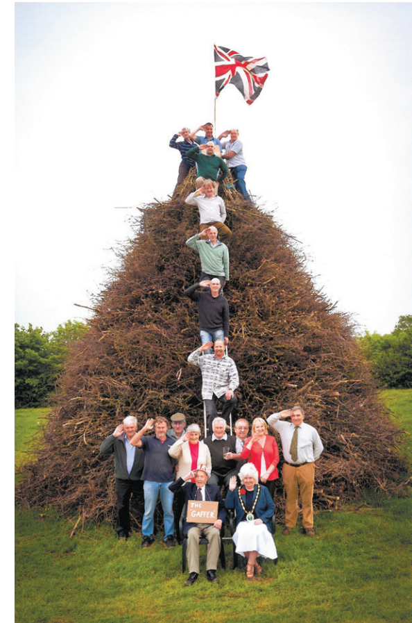
Bonfire Beacon, Shipston-on-Stour, Warwickshire, England.

10 To light the beacon: from poles 2m in length, prepare hand torches for lighting with paraffin-soaked rags wired around one end. Remember, paraffin is dangerous and great care should be taken. Paraffin can be used as directed, but it is still dangerous and should at all times be treated with great care - for example, always ensure all excess paraffin is drained off rags before use. If spilt on your clothes during the preparation of your beacon lighting you should replace those items of clothing before approaching any naked flames. In particular, always remember to replace the lid on any container of unused paraffin and store it in a safe place away from naked flames. Do not use an accelerant on the fire itself.