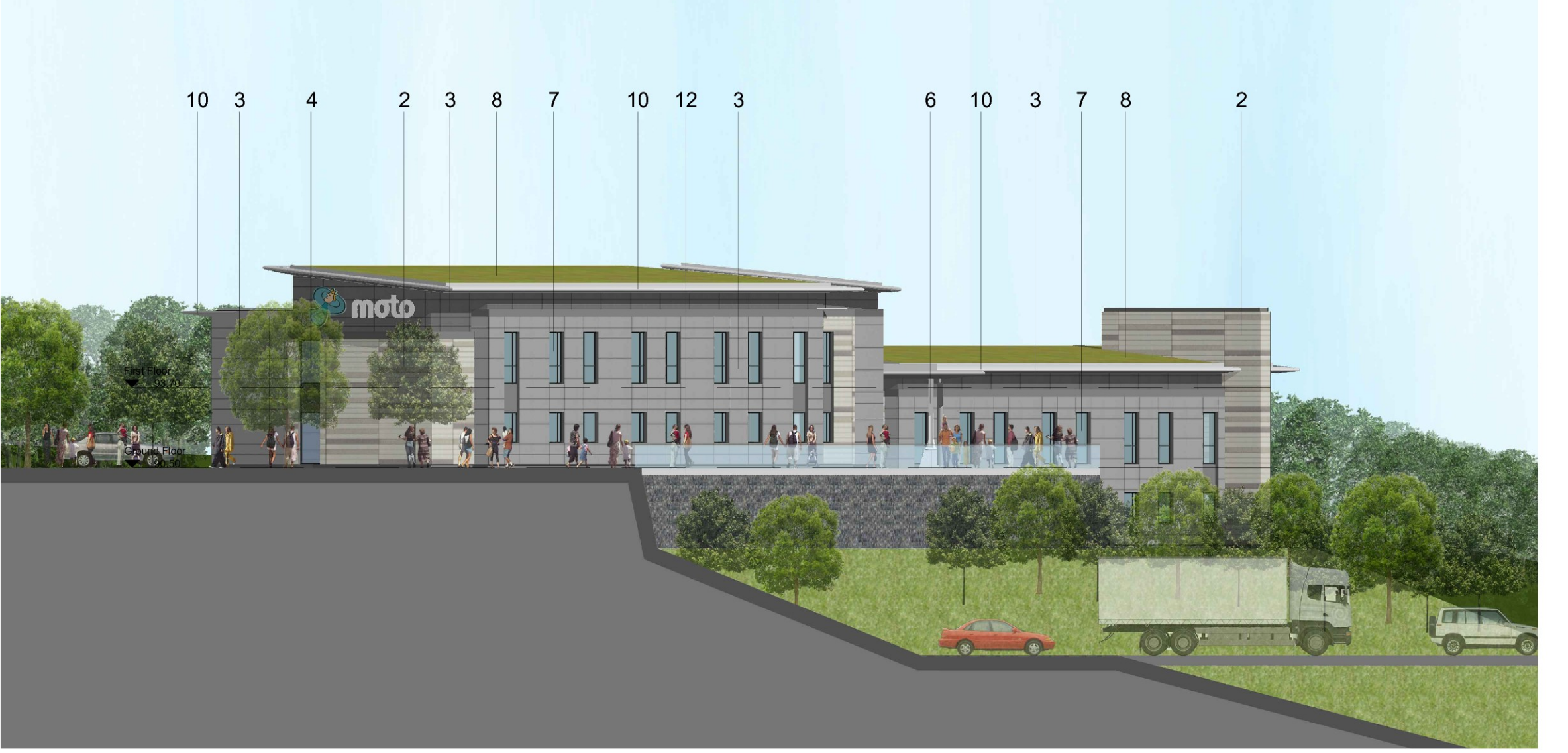
South East Elevation 1:200