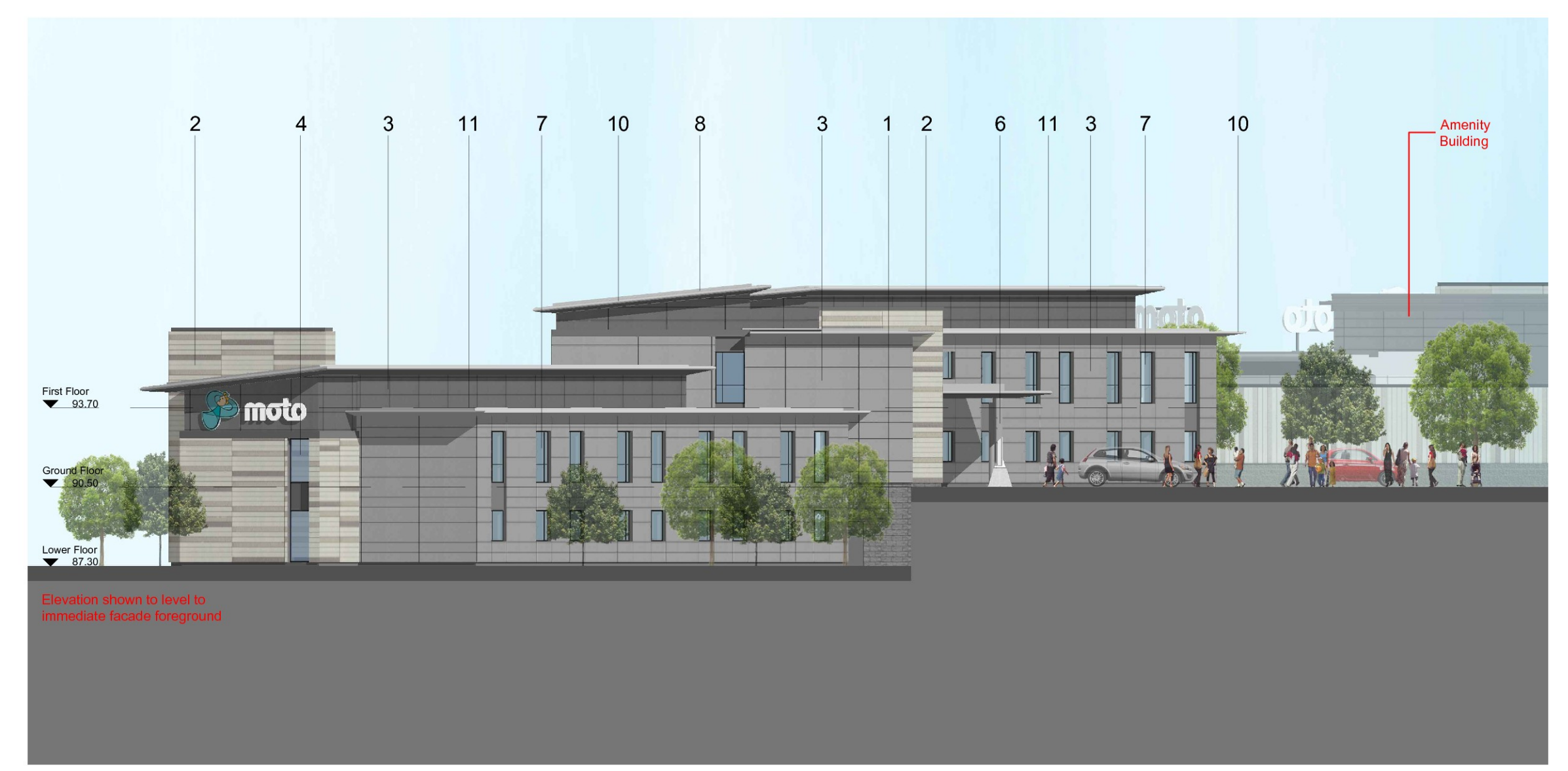
North West Elevation 1:200