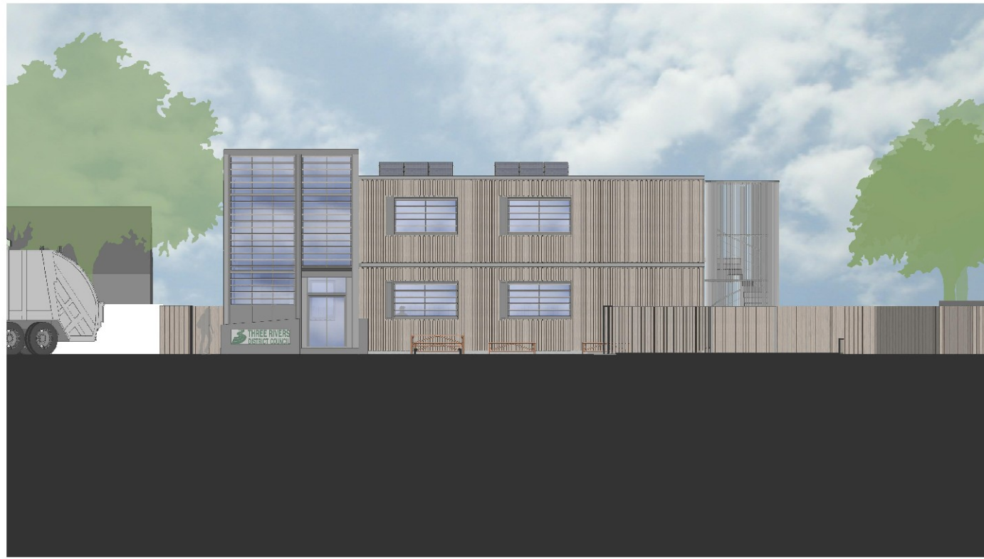
1 South elevation NTS