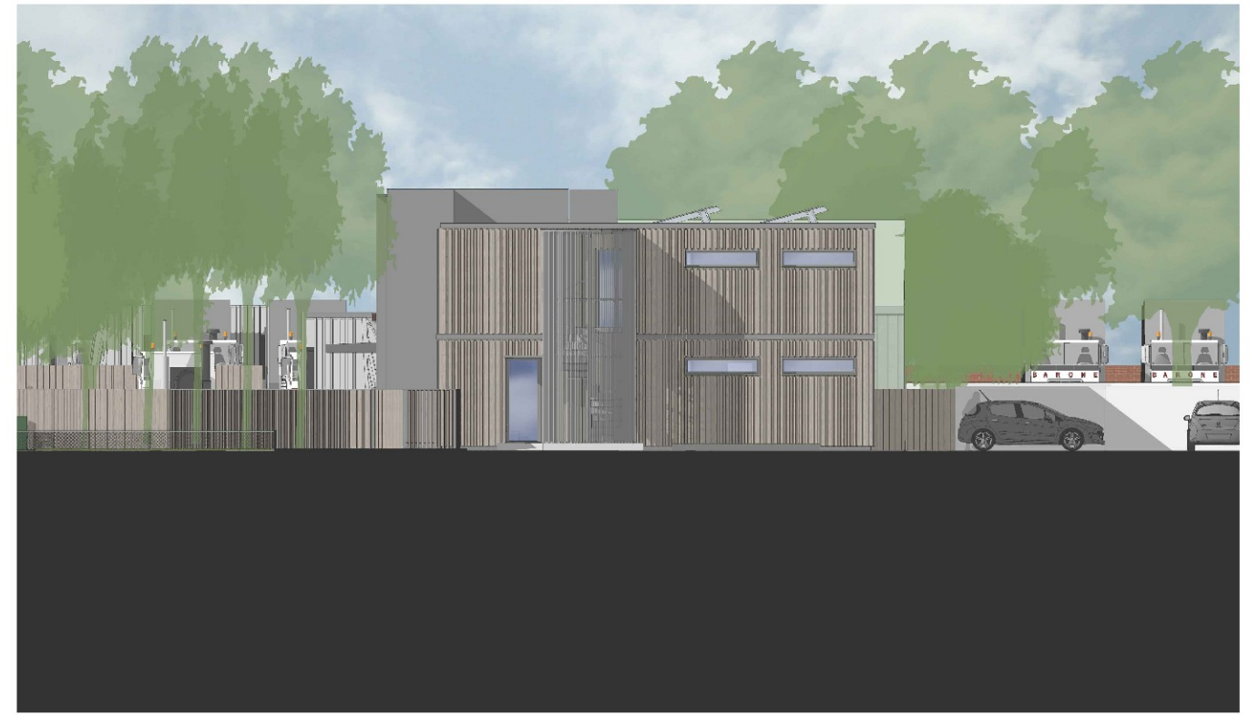
2 East elevation NTS