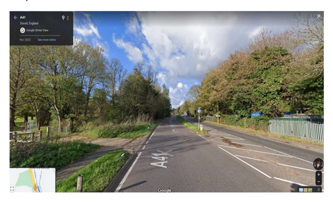
The developers transport consultant responded:

Proposals would upgrade the PROW and extend it to Langleybury House and footpath connection made to the River Gade (Grand Union Canal) tow path towards the existing PROW's northern end. A further shared foot/cycle route will connect Langleybury House and the footway on the western side of the A41. Whilst this network of foot/cycleways is fine for recreational walks by staff, it is considered it is inadequate in terms of ensuring compliance with Policies 1 (The Transport User Hierarchy) and Policy 5 (Development Management) with regards to ensuring a safe and direct sustainable access to the site from along desire lines. As previously discussed the A41 currently obstructs the desire line from Abbots Langley. HCC Highways advised the applicant to look at providing a pedestrian/cycle crossing across the single carriageway 40mph section of the A41 in the vicinity of the pedestrian/cycle access to the site to ensure that the development would be LTP4 compliant.