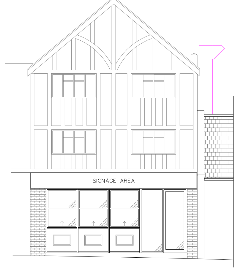
EXISTING FRONT ELEVATION WEST