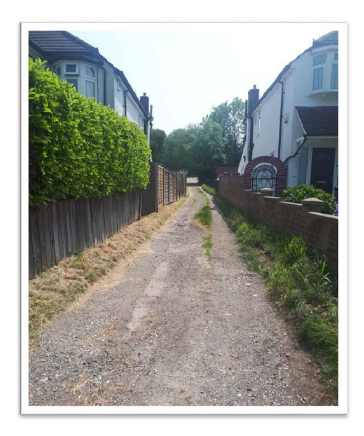
Danger: This is the other access to the polling station. It is an unmade track, suitable for single-file traffic only. Again there is no pathway for pedestrians, and nor is there any lighting.

There three columns designed to prevent 'light pollution' on one side of the car park. It is restricted to lighting the path between the car park and tennis courts. The columns which do not stand as tall as a streetlamp column.