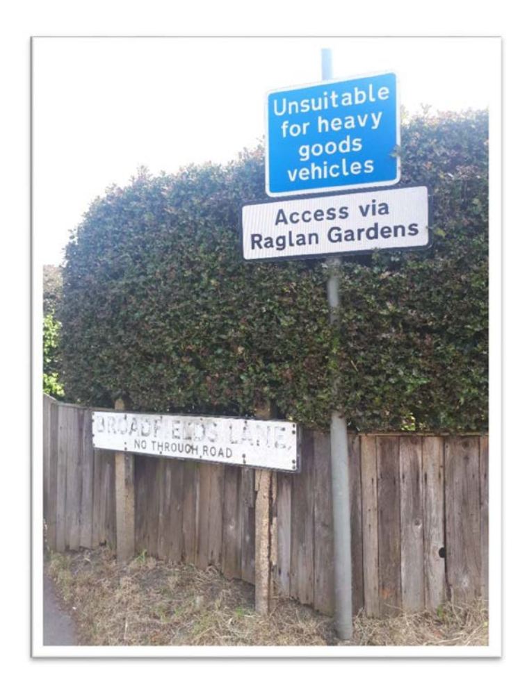
The narrow lane is Broadfield Lane and signs to the left-hand side of the entrance serve to underline the undesirability of using this access.