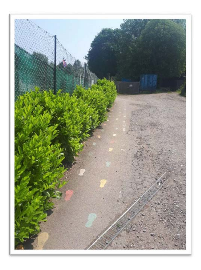
The badly lit path is up a reasonably steep incline, quite narrow and is bordered by the laurel bushes and the unmade road.