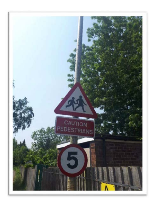
Danger: The warning signs are in place to alert drivers of a 5mph limit. Pedestrians have no option but to walk on the on the carriageway as there is no pavement whatsoever.

Narrow entrance from Raglan Gardens - believed not sufficiently wide for two vehicles to pass