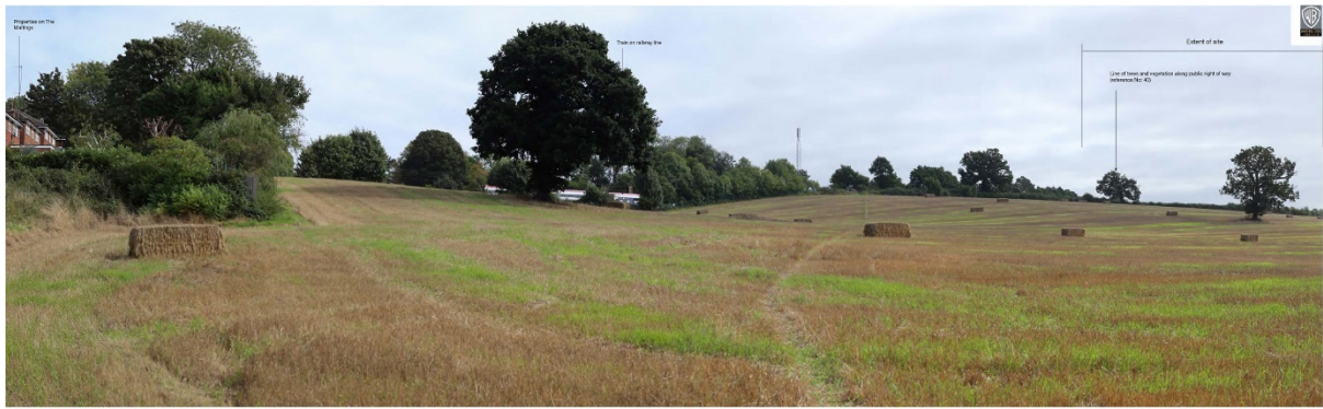
Viewpoint 5 - Taken from public right of way along reference No. 43, reference to Old Mill Road, looking south east.