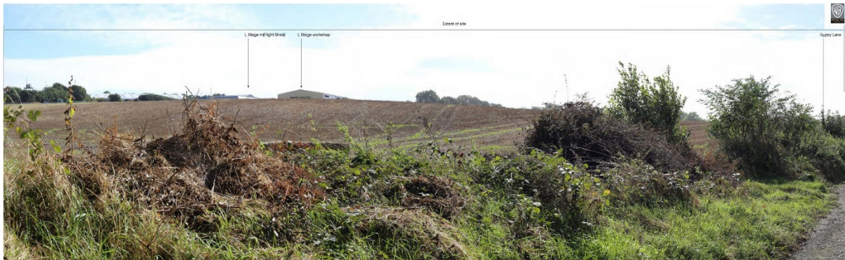
Viewpoint 8 - Taken from Gypsy Lane looking east towards the site