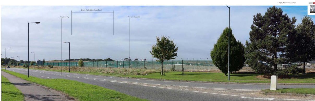
Viewpoint 6 - Taken from the entrance to an area of public open space on Ampthorpe Way looking south towards the site.