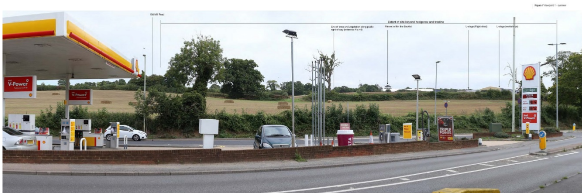
Viewpoint 2 - Taken from the bridge on the A11 (looking south-east)