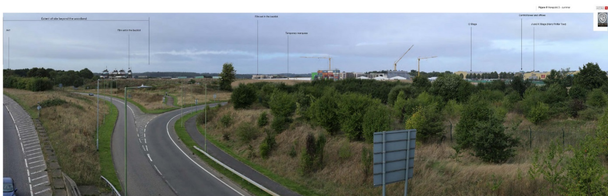
Viewpoint 4 - Taken from the bridge on the A11 (looking north-west)