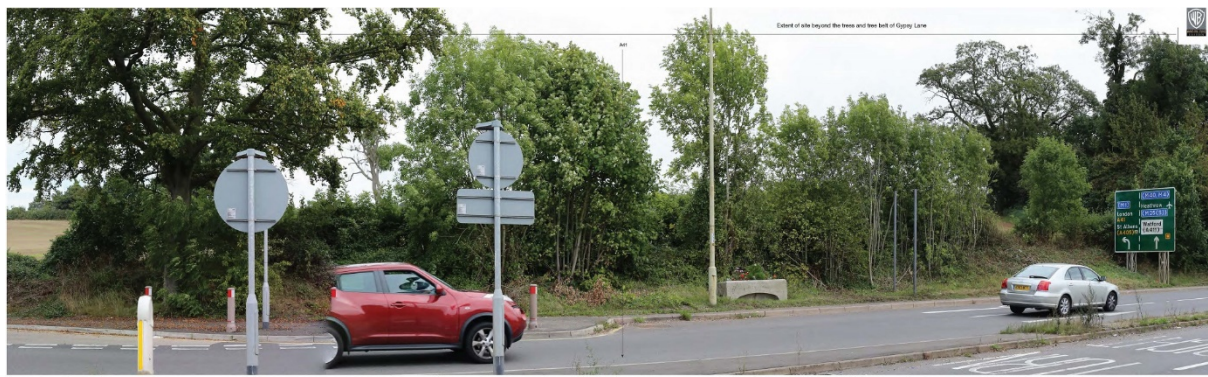
Viewpoint 1 - Taken from the bridge on the A11 (looking north)